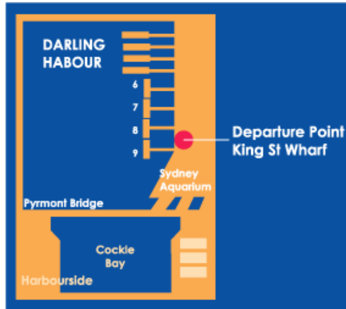
DARLING HARBOUR DEPARTURE POINT