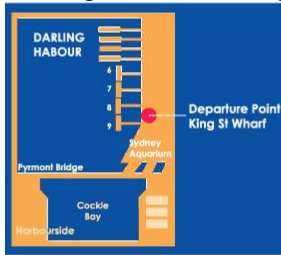
DARLING HARBOUR DEPARTURE POINT