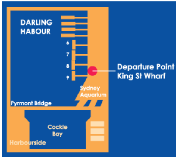
DARLING HARBOUR DEPARTURE POINT